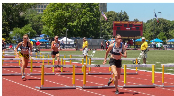
USA Track & Field Masters Championships