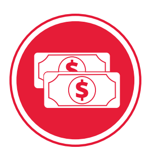
Story County tourism employs 1,720 with a payroll of $33.8 million