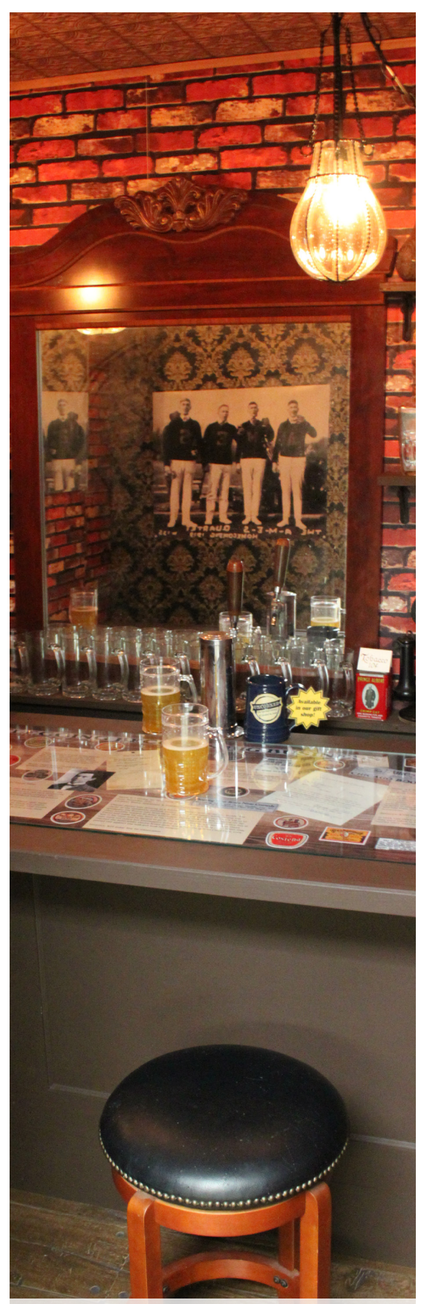
Uncorked: The Spirited History of Alcohol in Ames