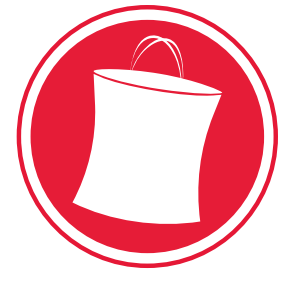
Provided 1,500 + bags at ISU New Student Summer Orientation