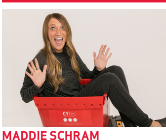
IT & Registration Services