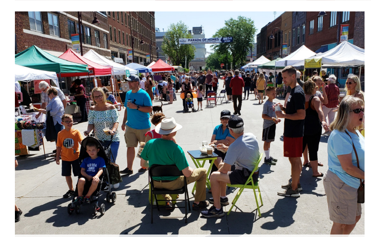
Ames Main Street Farmers' Market